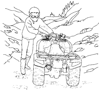
Be sure your legs are clear of the wheels.

If the hill is not too steep and you have good footing, you may be able to walk the ATV back down the hill. Make sure your intended path is clear in case you lose control of the ATV.