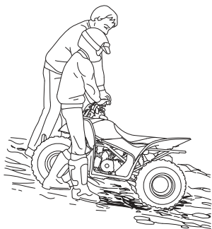
Body position for backing down a hill.